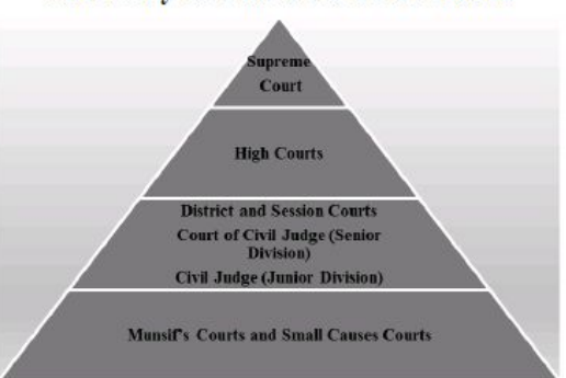
Hierarchy of Courts for Civil Matters

The Supreme Court and High Courts have the special constitutional responsibility of enforcing the "Fundamental Rights" of the citizen, as enshrined in Part III of the Constitution.