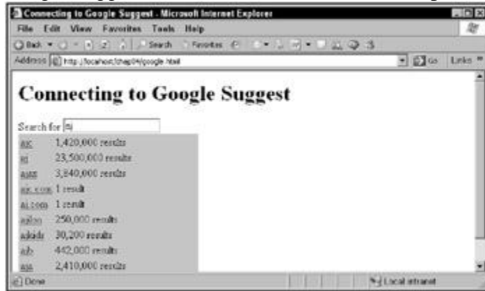
Figure 4.7: Connecting to Google Suggest with a custom page

You can create a search page yourself that connects to Google Suggest, and download JavaScript from Google Suggest to do so. You can see this example at work in Figure 4.7.