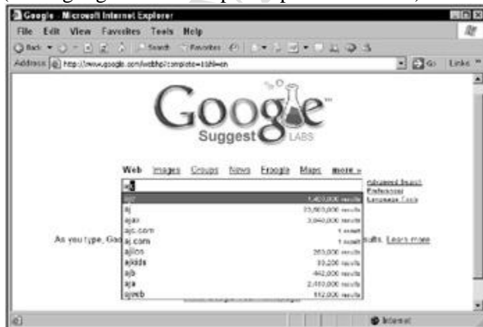
Figure 4.6: Google Suggest

Among famous Ajax applications, there are a few that stand out, such as Google Suggest ( www.google.com/webhp?complete=1&hl=en ). It is shown in Figure 4.6.